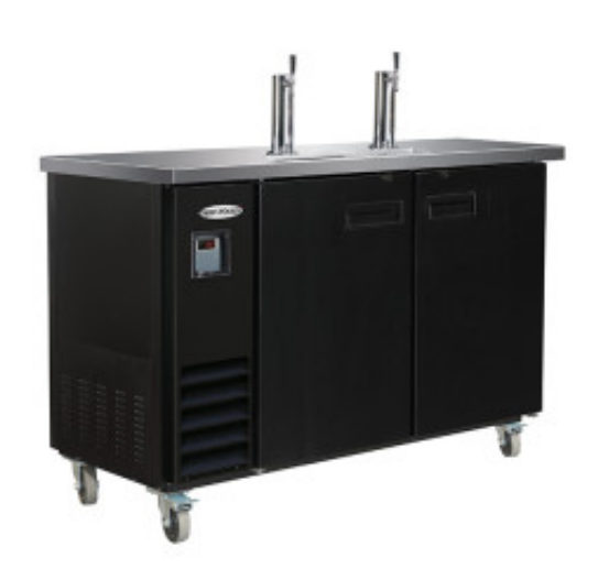
Short Description 49 in. Unit / 2 Tower